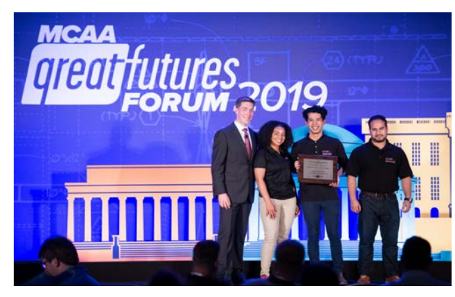
East Bay Hayward receives their Charter Plaque